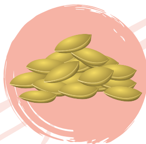
Semillas de albaricoque